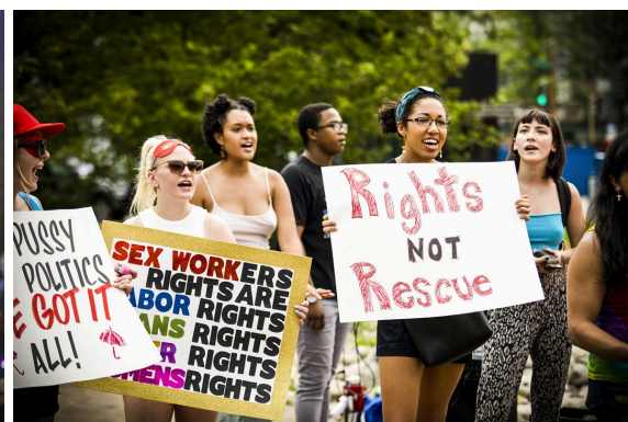
Image descriptions: at the top left is a black-and-white eighteenth-century image of a woman with a flowing dress clutching her necklace. At the top right is a nineteenth-century cartoon titled "The Great Social Evil" that depicts two women talking to each other in an alleyway. On the bottom left is an image from the film "Hustlers" in which characters played by Jennifer Lopez and Constance Wu are looking at each other. On the bottom right is a photograph from a protest for sex worker's rights.